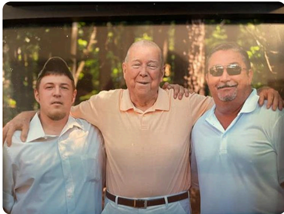
Me, Grandpa & Dad At Mountain View