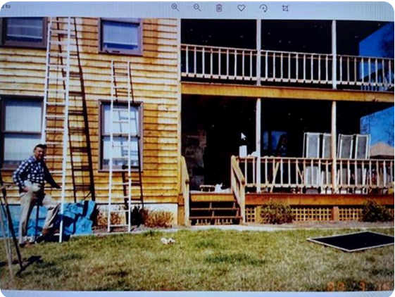
Grandpa Painting Chesterfield