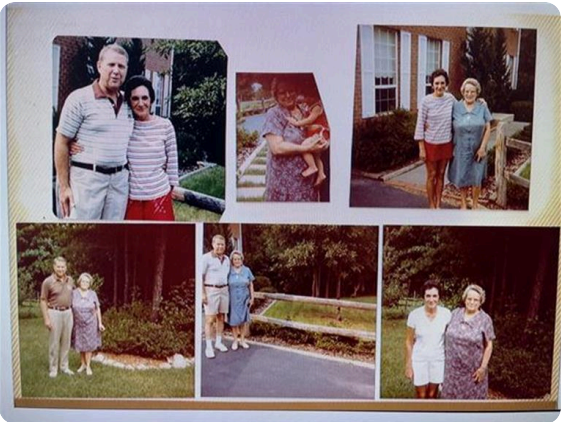
Grandma & Grandpa and Great Grandma At Oakton