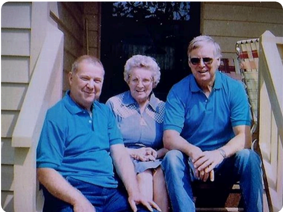
Grandpa, Great Grandma & Uncle Bunk At Chesterfield