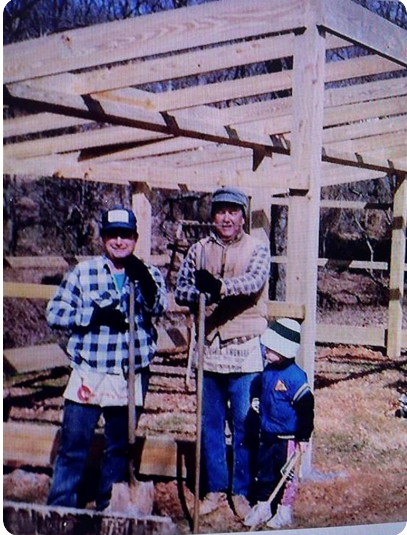
Grandpa & Dad Building Pole Barn At Chesterfield